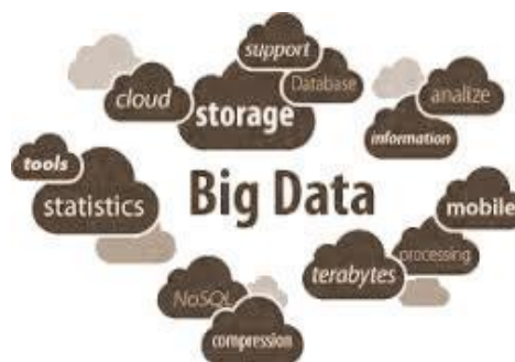
Fig 1.1: Big Data

Big data is typically described by the first three characteristics. The term big data is believed to have originated with Web search companies who had to query very large distributed aggregations of loosely-structured[23] data. Big data analytics requires capturing and processing data where it resides. This paper explores the value of data at the edge of networks, where some of —biggestl big data is generated. As the use of sensors and devices as well as intelligent systems [4] [5] [6] continues to expand, the potential to gain insight from the flood of data from these sources becomes a new and compelling opportunity. Businesses that can harness the power of big data at the edge and unlock its value to the organization will outperform their competitors with greater capabilities to innovate creatively and solve complex problems whose solutions have been out of reach in the past. Below-sometimes referred to as the three Vs. However, organizations [6] [7] [12] need a fourth—value—to make big data work.