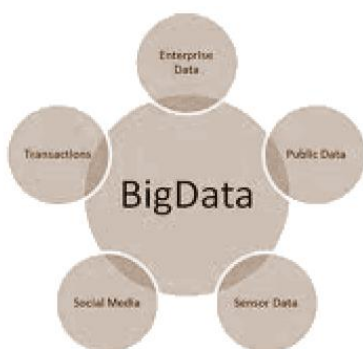
Fig 1: Big Data

The explosion of big data is testing the variety [1] [5], and velocity of this flood of complex, capabilities the explosion of big data is testing the variety [1] [5], and velocity of this flood of complex, capabilities of even the most advanced analytics tools. IT is challenged by the sheer volume, structured, semi structured, and unstructured data which also offers organizations exciting opportunities to gain richer, deeper, and more accurate insights into their business.